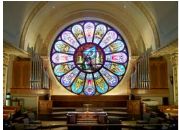
St. Mary's - Tiffin